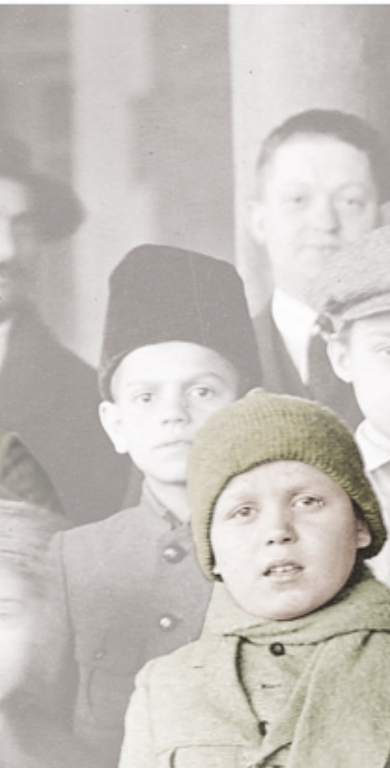
Montage made up of photos courtesy of the New York Historical Society and the Library of Congress.